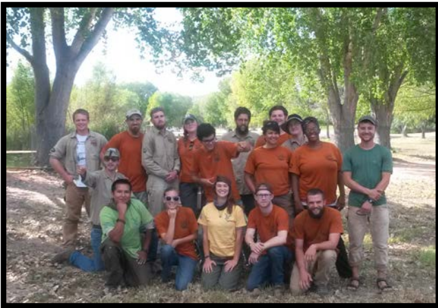
Fall 2015 AZCC Youth Crew